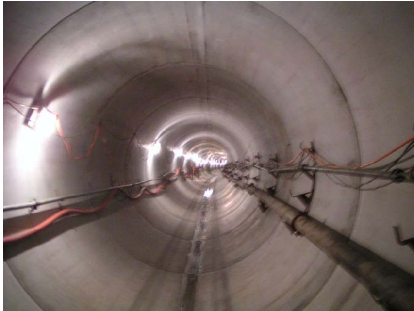
Fig.5 View through the finished tunnel, before installation of cables.

The pipe-jacking construction method is available to cope with both cohesive and non-cohesive soils in dry or water bearing conditions. Excavation techniques are also available for jacking through rock, boulders or mixed ground conditions. Therefore direct benefits of pipe jacking methodology are: