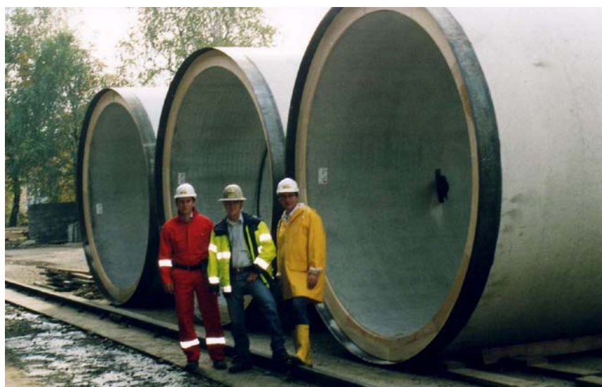
Fig.2 Precasted pipes stored in the vicinity of the start shaft (Manufacturer: MABA, Sollenau).

The pipe-jacking drive is performed over precasted pipes that are maximum 3.20 meter long, having outer diameter of 3.68 m, the pipe wall thickness of 25 cm and the weight of 21.6 tons each. All together there are 277 pipe pieces DN i 3180 manufactured with the inner diameter of 3.18 m and in the concrete class C60/75/XC2 (see fig.2). Concrete pipes are reinforced with the average amount of the reinforcement about 64 kg/m 3 of concrete volume and having concrete cover of 3.5 cm. The conductivity of the reinforcement is provided by earthing switches on both pipe ends.