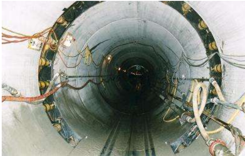
Fig.4 View through the tunnel in construction : intermediate press-station (called "Dehnerstation").

After the whole pipe-jacking tunnelling is finished (see fig.5) three shafts (at the beginning, in the middle and at the end of the project) should be excavated and connected to the main cable tunnel. Connection from the tunnel toward shaft will be constructed by conventional tunnelling using principles of NATM : excavation in steps using sprayed concrete of class SpB25/J2/GK11 and bored anchors as primary support. Final lining will be performed in reinforced concrete and will be conventionally performed on cross-adits and shaft structures (Hörlein et al., 2004).