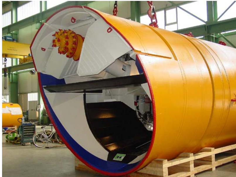
Fig.3 Open face shield (Manufacturer: Herrenknecht, Schwanau).

Excavated material has been transported from the face to the machine rear part by the moving band and then by wagon to the start shaft where was picked up to the surface over one portal-crane. Near to the start shaft was temporary disposal area for excavated material and a storage for pipes that were transported to the bottom of the start shaft with the same portal crane. The pipe-jacking was performed by pressing station that was installed in the start shaft and equipped with 6 hydraulic jacks with 300 tons capacity each that may activate maximum full pressure ring force of 1800 tons (ARGE Kollektor Graz, 2004).