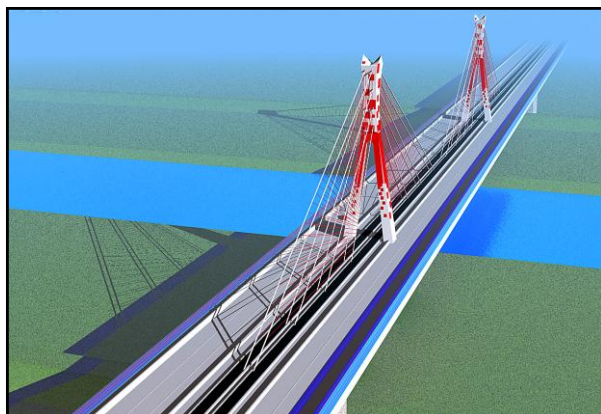
LIGHT RAIL BRIDGE OVER SAVE RIVER