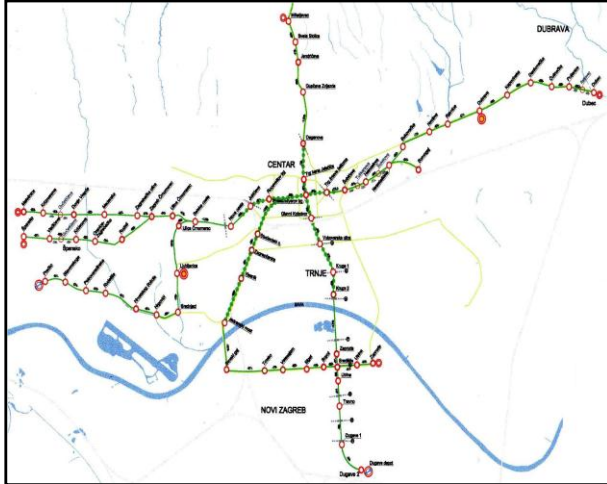
LIGHT RAIL NETWORK