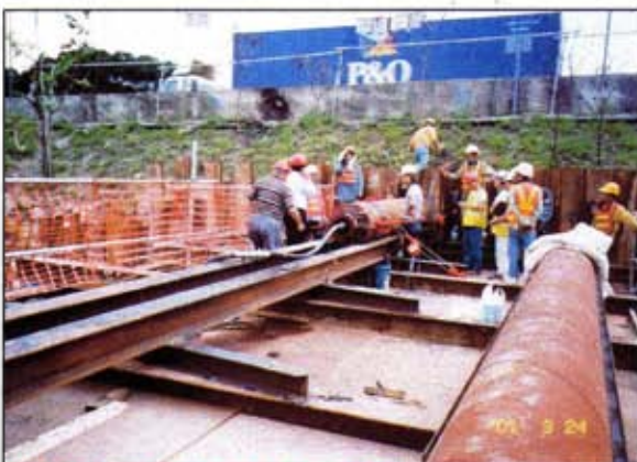
PIPE JACKING CLOSE TO SURFACE