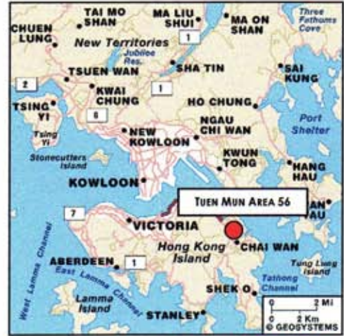
PLAN OF HONG KONG