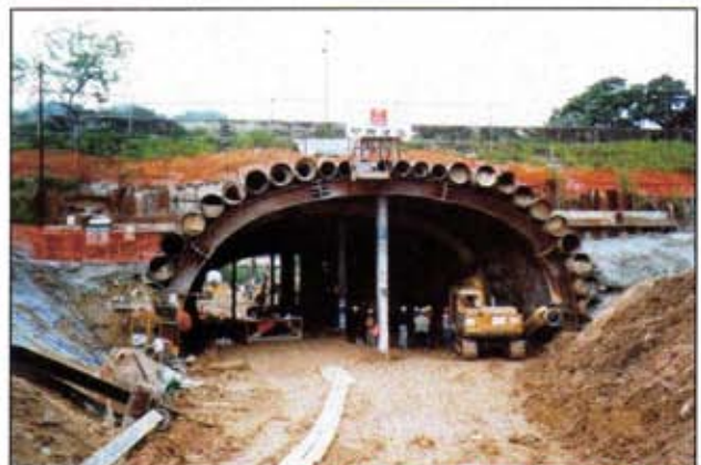
EXCAVATION NEARLY COMPLETED