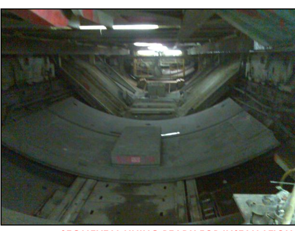
SEGMENTAL LINING READY FOR INSTALLATION