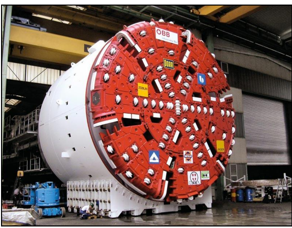
TBM WITH D_{EXC} = 10.60 M IN MANUFACTORY HALL