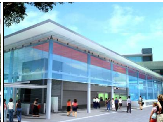
BUONA VISTA STATION