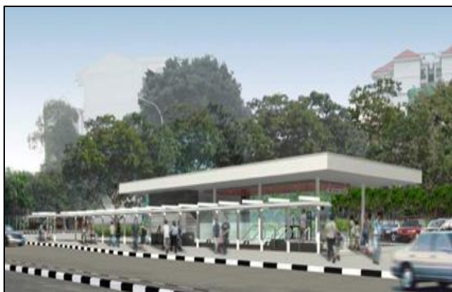
HOLLAND VILLAGE STATION – ENTRANCE 1